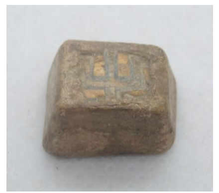
TT 139/19, found in Western Isles

Lead weight with enamel, dating to c. 9<sup>th</sup>/10<sup>th</sup> CE