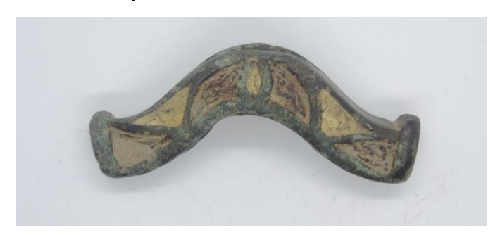
TT 45/19, found in Midlothian

Hilt guard, dating to the Iron Age, c. 200 – 1 BCE