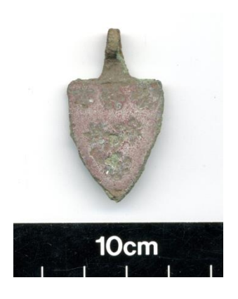
TT 75/19, found in Perth & Kinross

Heraldic harness pendant, c. 1200 – 1400 CE