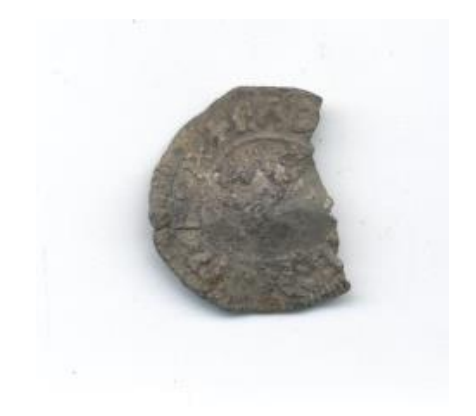
TT 99/19, found in Fife

Silver penny of Eadgar, dating to c. 972 - 975 CEI