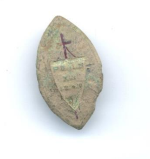
TT 21/19, found in Angus